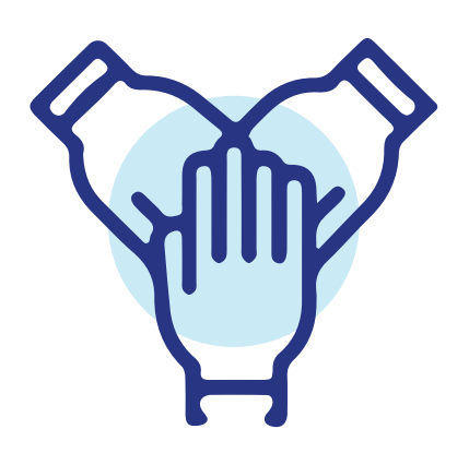
Figure 1: Vision for Recovery