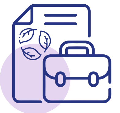
Good, green jobs and fair work